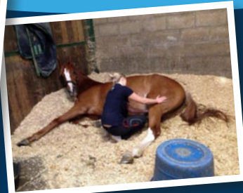
Runner up Kay Burt

If you want to take a look at all our fantastic entries, head over to our Facebook page and browse our "Pampered Ponies" album!